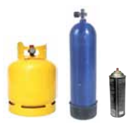
Aerosols (Deodorant, Air Freshener etc.), Compressed Gas Cylinders, Aqualungs