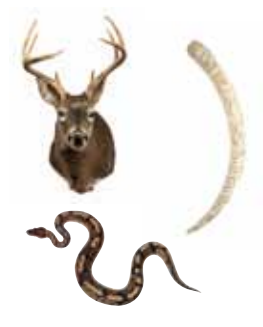
Animal Skins (non-domesticated), Furs, Ivory & Live Animals

Class 2 - Perishable Goods, Plants & Seeds